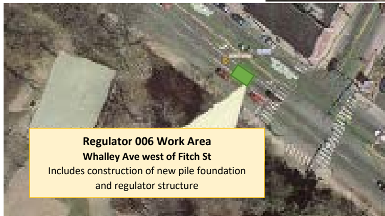
3. CWF 2016-03 Regulator 006