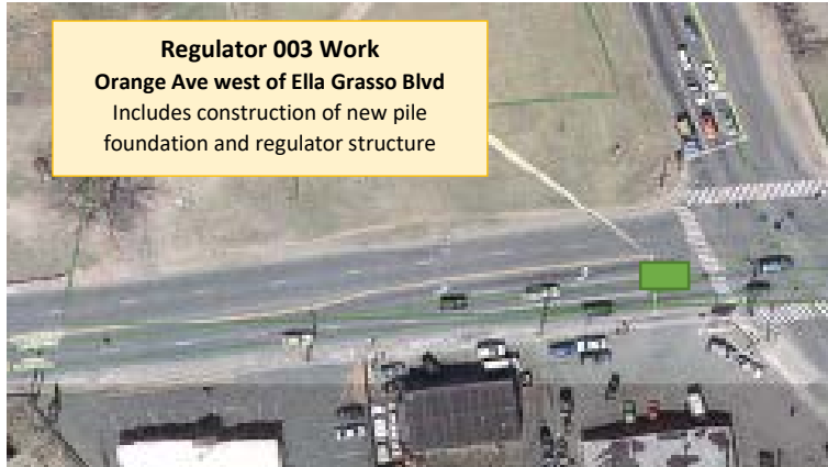
1. CWF 2016-03 Regulator 003