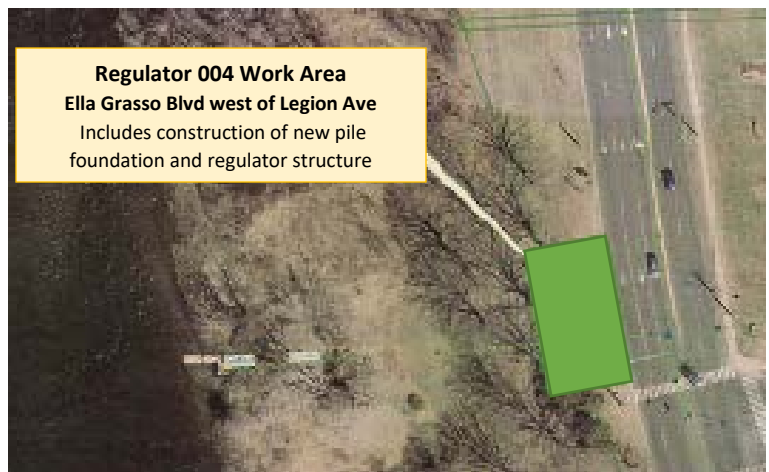
2. CWF 2016-03 Regulator 004