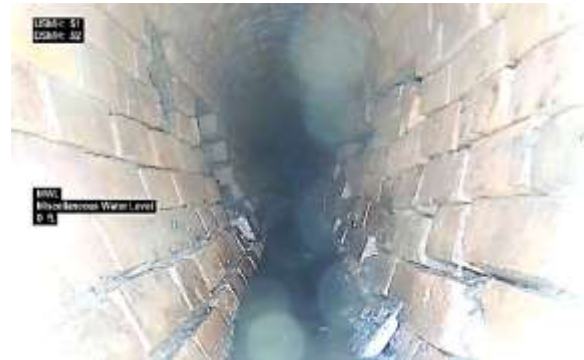
Photo of existing brick sewer to be lined with cured-in-place pipe.

*Due to dynamics of construction schedule, weather and other factors, dates and times are subject to change.